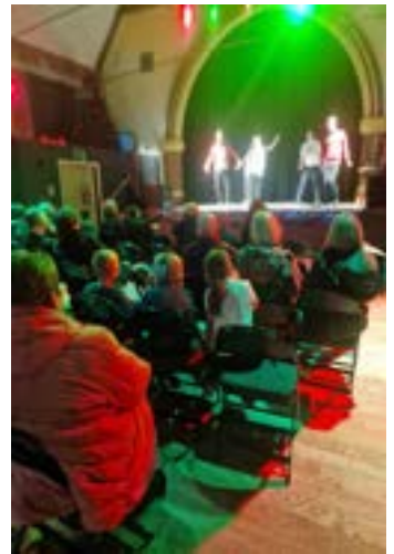
Children from Cleasewell Hill School rocking around that Christmas Tree.

The event was made extra special with a visit from Santa Claus himself! Thank you to all those who attended! We hope to see you again next year!