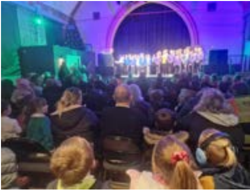
Children from Stead Lane Primary School and 'Bedlington Station Primary School' performing some feel good carols.