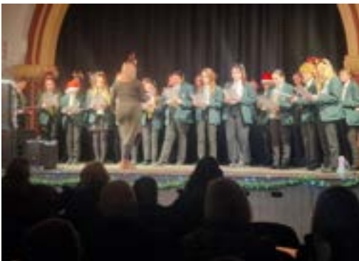
Children from Bedlington Academy Choir wowing the crowd with their harmonies.

Our annual Christmas Light Switch On took place on Thursday 28 November and was a huge success, with a record number of spectators attending to celebrate the start of the festive season. The support shown for the children of Stead Lane Primary School, Bedlington Station Primary School, Cleasewell Hill School and Bedlington Academy was outstanding, showing the true spirit of the community and the support for local talent.